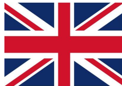
Exchange of views

Today, the AFCO Committee will hold the first debate of 2017 on the withdrawal of the UK from the Union, which is the continuation of the ongoing regular debates on this subject. The AFCO committee welcomes today Scotland and Gibraltar representatives for an exchange of views with those territories, where the majority of citizens voted to remain in the European Union in the 23 June 2016 referendum.