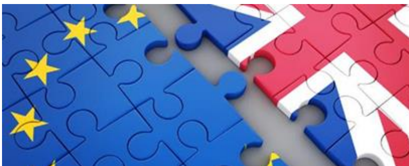
Report by the Chair, Danuta Maria Hübner (EPP)

AFCO meeting will continue with a report by Professor Danuta Hübner, AFCO Chair and member of the European Parliament's Brexit Steering Group, on the current state of play of negotiations between the EU and the United Kingdom. As AFCO is the Committee responsible for the institutional consequences of the UK's withdrawal, Brexit is a top priority and staying abreast of recent developments is crucial to the Committee's work.